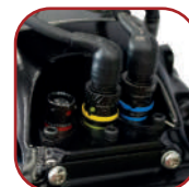
E-SHUTTLE (On demand)